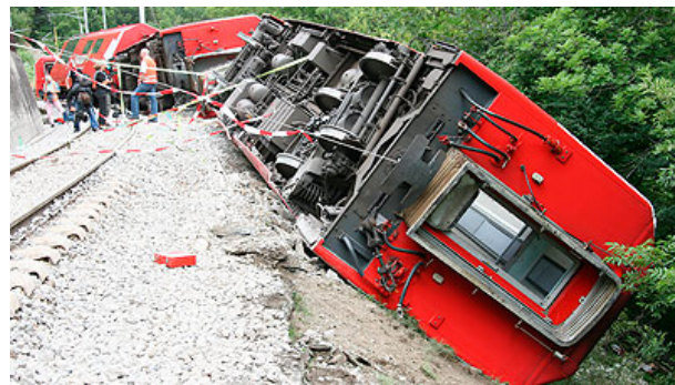
Not a sight you ever want to see.. A Swiss train off the rails...

Check out this issue of the Horn now also on www.natives.co.uk